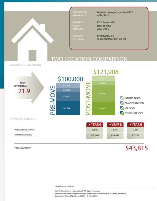
Two Location Comparison